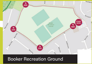
Booker Recreation Ground