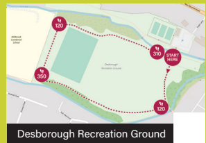
Desborough Recreation Ground